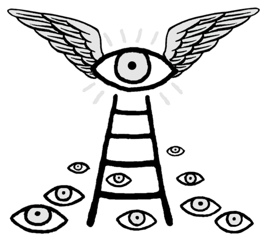
Illustration: Savina Hopkins

Another important finding emerged: in those cases in which psychotropic medication was combined with psychotherapy, the drugs did not perform consistently. As with talk therapy, effectiveness depended on who prescribed the drug. People seen by top providers achieved gains from